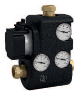
LK 810 2.0