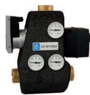
LK 811 E Eco